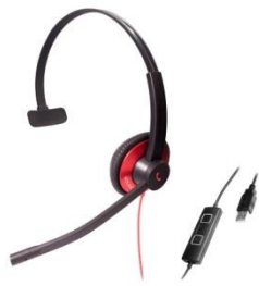
Epic 511 Red