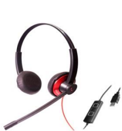
Epic 512 Red