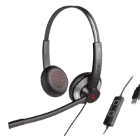
Epic 512 Gray