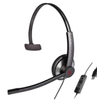
Epic 511 Gray